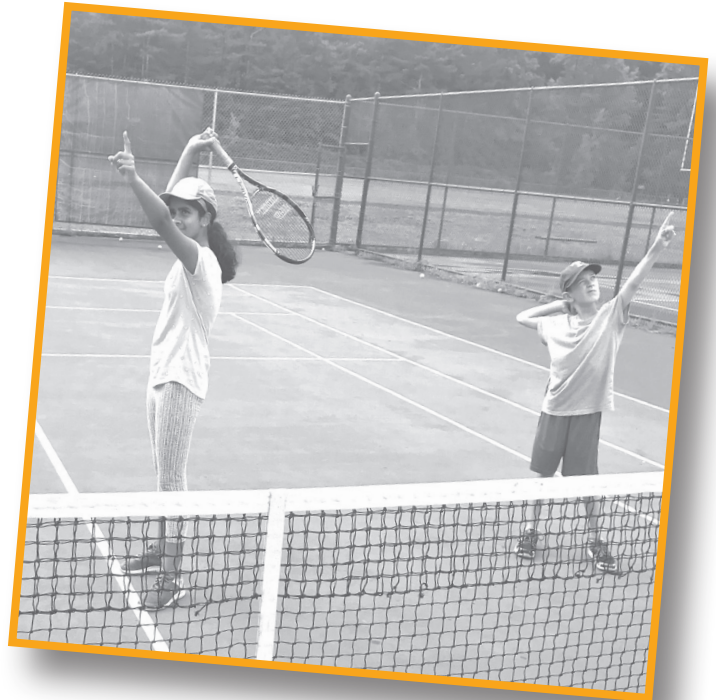
MLTC participants are in trophy pose position practicing their over-heads.

Dates: Tuesdays September 3, 10, 17, 24, October 1, 8, 15 Rain date: October 22 Time: 3:00-4:00 p.m. Fee: $126 Resident/$136 Nonresident Location: Stony Brook Middle School Courts Instructor: Matt Chandler